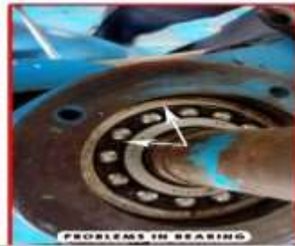
Fig:6Wear in the bearing

Since the shaft is not moving properly therefore the gap between the bearing bush and the shaft decreases which results in unwanted noise and hence the efficiency of the [8] turbine decreases.