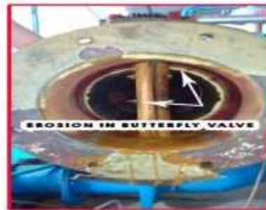
Fig.3: Erosion in Butterfly Valve

Butterfly valves [11] are used as safety hydraulic systems for low or medium pressure with minimum head loss when the water is passing through the rotor. They are used as gates and emergency devices at the turbine inlet or at the intakes. Due to not in regular [7] use and improper maintenance different parts of valves gets eroded and causes a number of leakages in joints, due to which it was not working properly causing a discontinued flow of water through it.