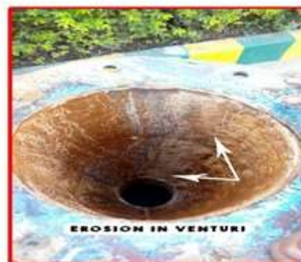
Fig.2: Erosion in Venturi

Venturimeter consisting of two [1] conical parts with a short portion of uniform cross-section in between. The short portion has minimum area and is known as throat. Our turbine was not in a working condition for a long period, therefore it got eroded and at the time of water flow some bubble formation occurs near the throat which causes major problem to the machinery and it [1] reduces the turbine efficiency, due to unsteady pressure, which is develop due to unsteady flow of water causes major problem to the other parts of turbine.