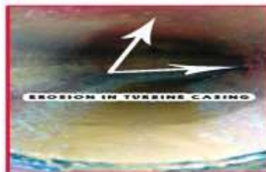
Fig.4: Erosion in the Turbine Casing

Casing [11] may be said to an enclosing shell, tube, or surrounding material. Due to improper flow of water in venturimeter as well as through valve and due to surface roughness, there is a development of the scales on the surface of the interior parts of the turbine causes the irregular flow of water inside the casing which causes leakages in casing[4] and hence reduces the efficiency of the turbine.