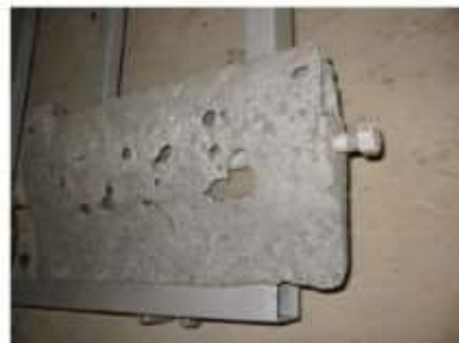
Fig.5: Erosion in the gate

Hydraulic turbine blades are essential part of large hydropower equipment's. Accurate[6] measurement of the blade has crucial impact on the overall operational efficiency and services. Vane blades get damaged due to continuous striking of high pressurised water. This high pressure of water cannot be known with accuracy because of improper working of various parts of turbine. Hydrodynamic load on blades developed unwanted stress which results blades gets damaged.